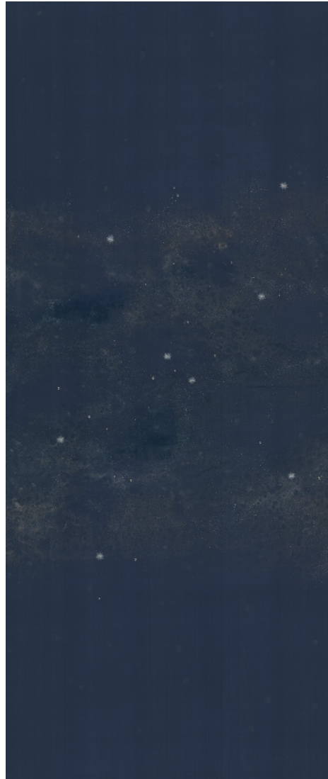
01 Dark Matter on Indigo Silk