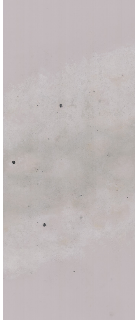
02 Dew Drops on Custom Silk