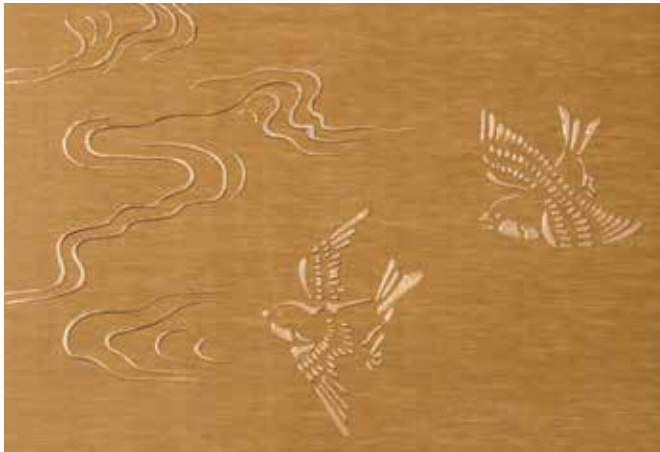
07 Aso on Woodbine Faille