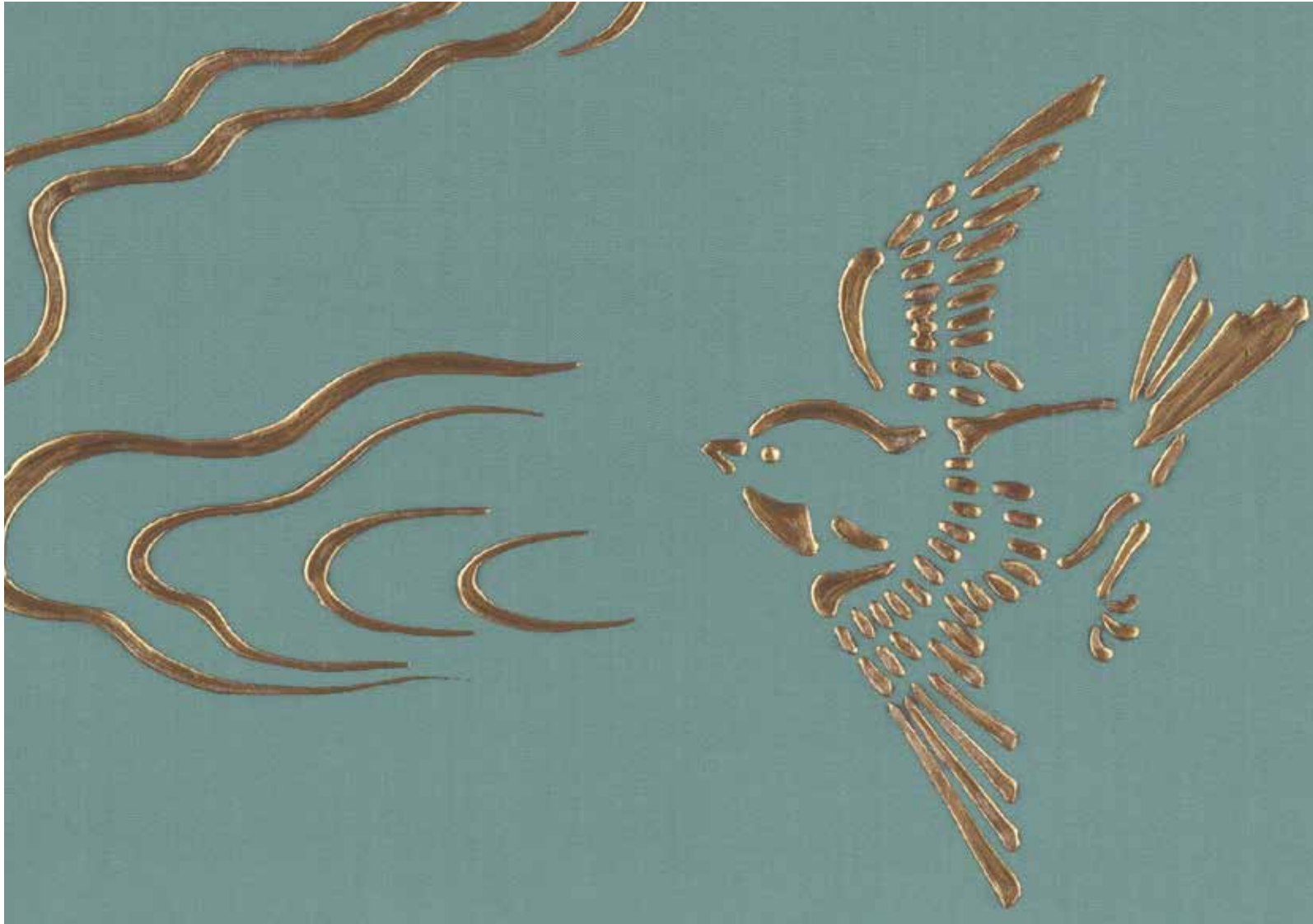
Mishima in Fuji