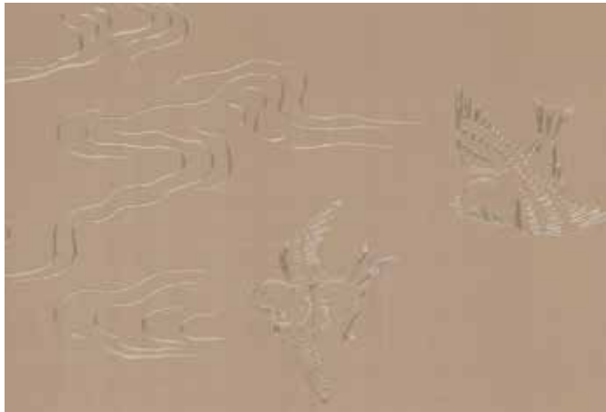
01 Sakura on Pebble Silk