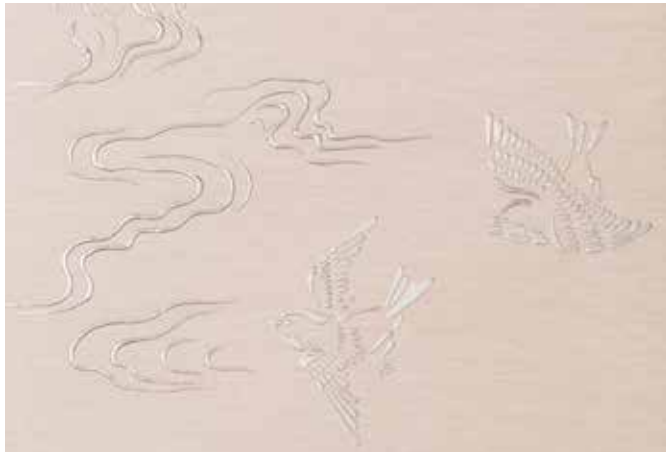
06 Tsurumi on Pearl Grey Faille