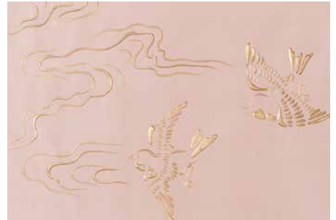
08 Asama on Mademoiselle Silk