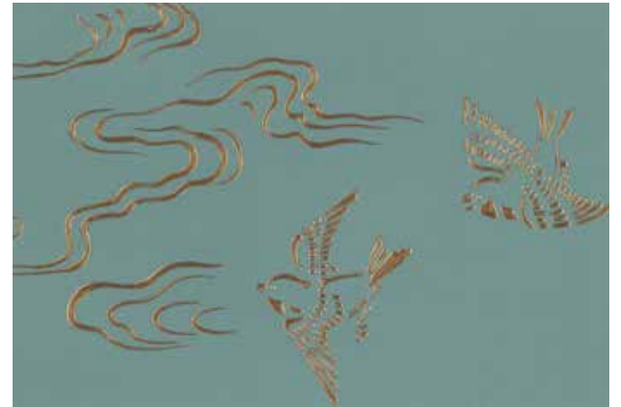
04 Fuji on Canton Silk