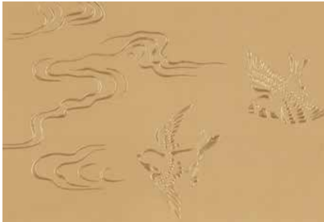
02 Unzen on Sahara Silk