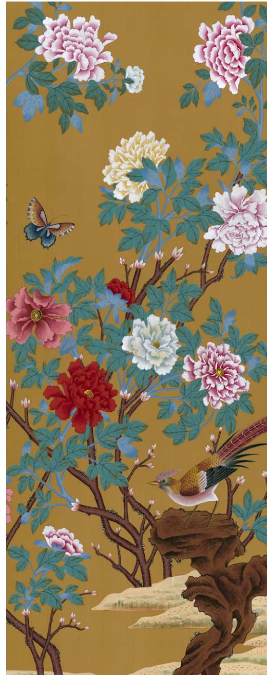
02 Alexis on Bronze Silk

Ivory and luminous calm. Refined splendour worn with effortless grace.