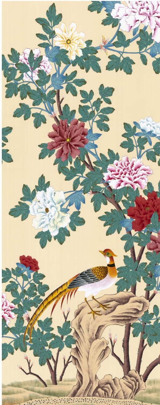
01 Krystle on Putty Silk

Ivory and luminous calm. Refined splendour worn with effortless grace.