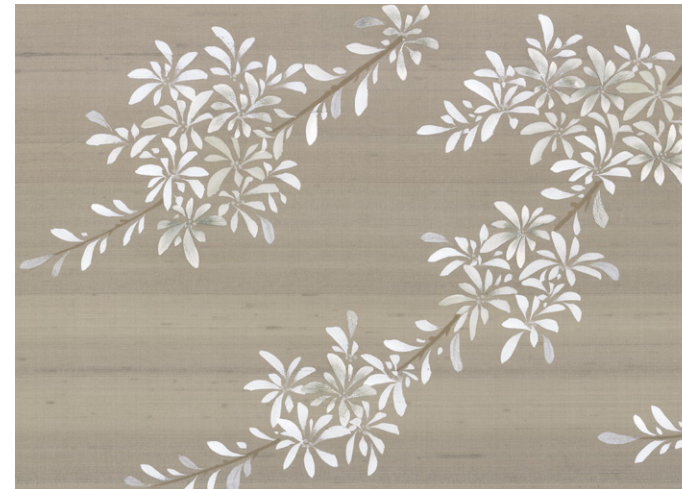
05 Avium on Silver Lichen Dupion Silk