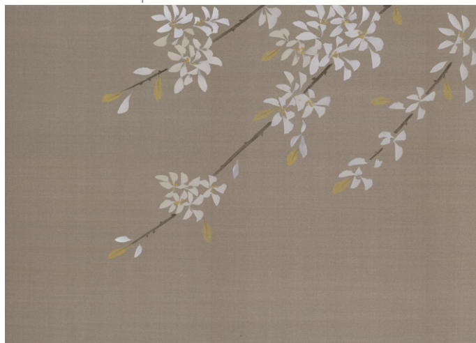
03 Ukon on Oxide Strata Silk