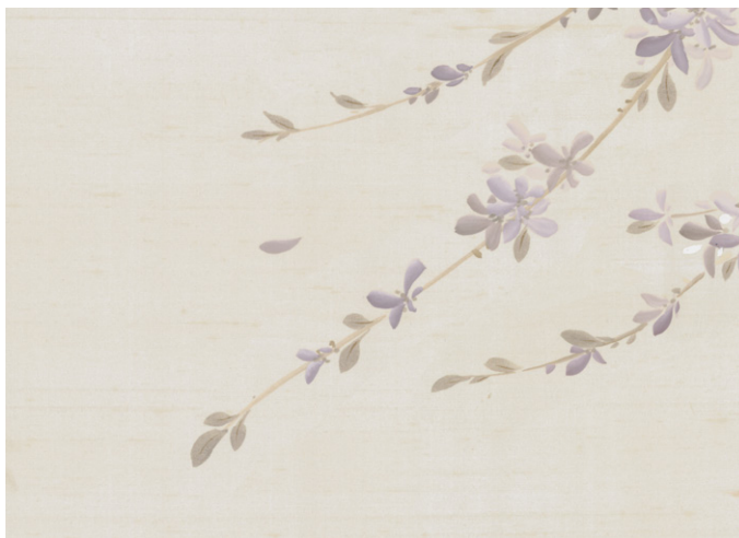
04 Pendula on Lepiota Dupion Silk