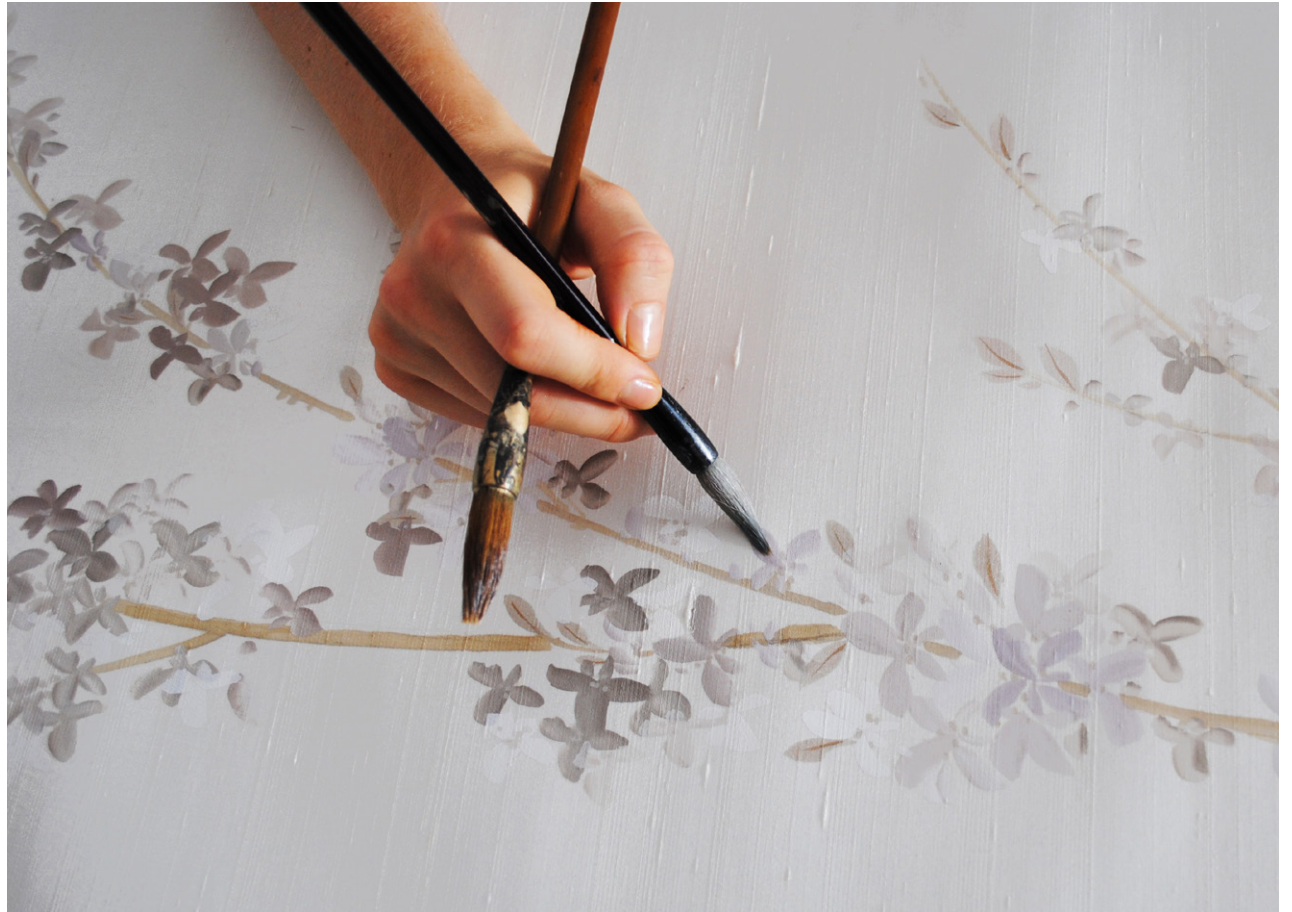
IMAGE Close-up of Branches in the Breeze in Pendula

With branches falling from the top of the design, this wallcovering is particularly well-suited to rooms with dado rails, half-height panelling or lots of furniture.