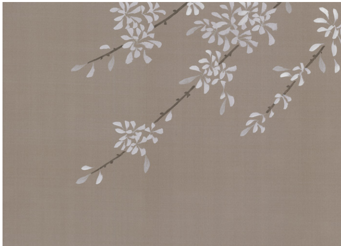
02 Alba on Zinc Strata Silk