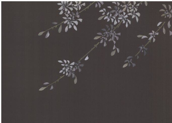
01 Okame on Graphite Silk