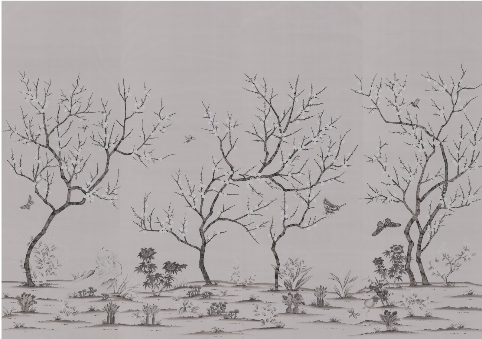
02 Dusk on Custom Strata Silk