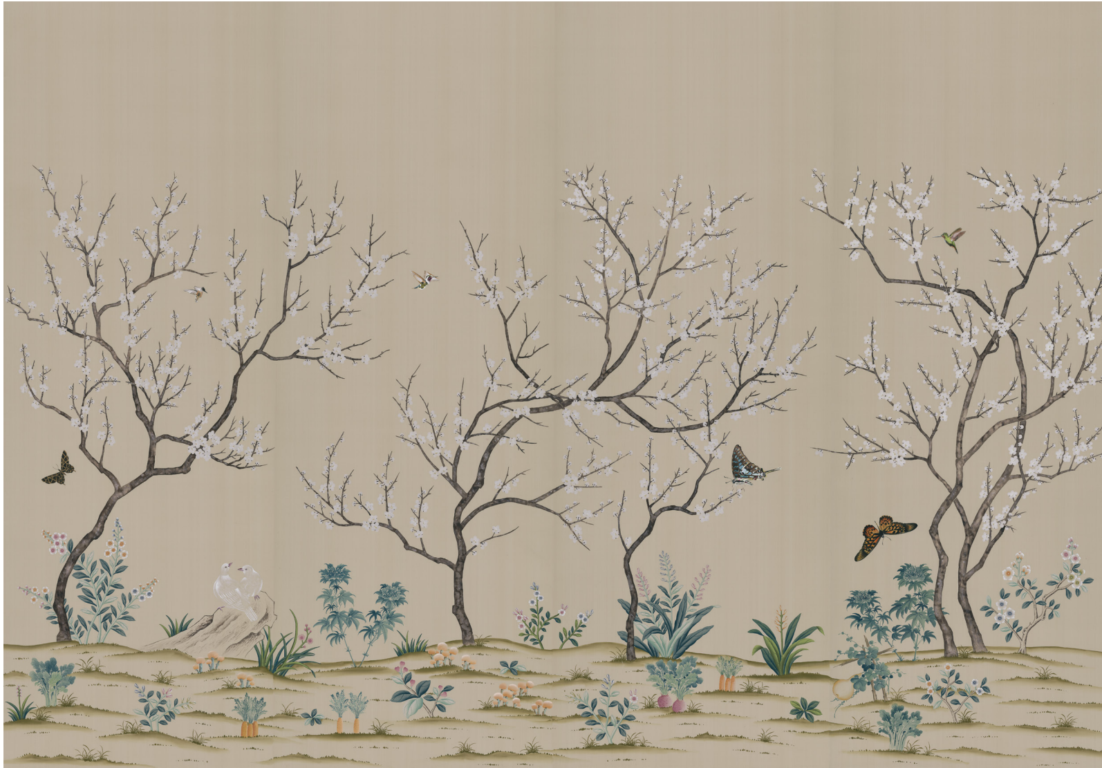
01 Dawn on Platinum Silk