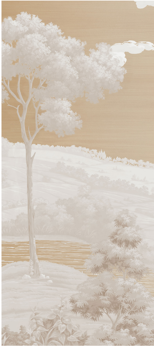
02n Birch on Hand-Brushed Nacre