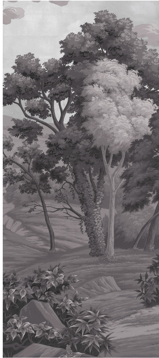
03a Saxe on Hand-Gilded Paper