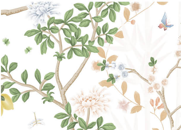
12 Pastel on Pearl Non-woven Paper