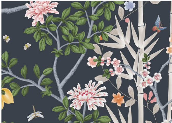
03 Inkwell on Textured Non-woven Paper