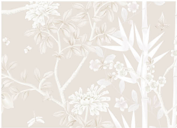
09 Pale Ivory on Textured Non-woven Paper