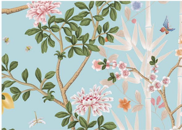
01 Sky Blue on Textured Non-woven Paper