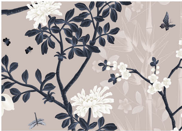
10 Midnight on Pearl Non-woven Paper