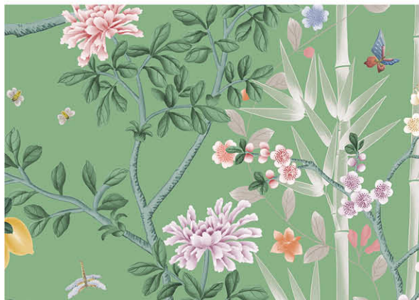
11 Bright Green on Textured Non-woven Paper