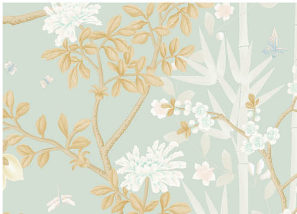
13 Harbour on Textured Non-woven Paper