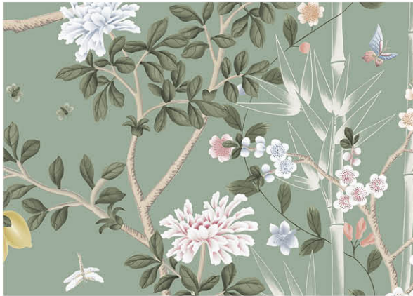
04 Seafoam on Textured Non-woven Paper