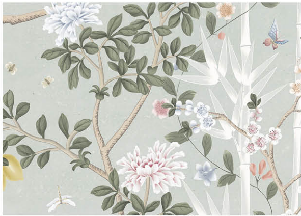
06 Soft Breeze on Textured Non-woven Paper