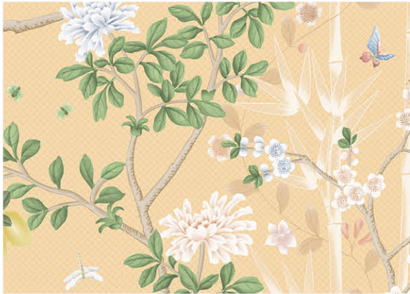
05 Butterscotch on Textured Non-woven Paper