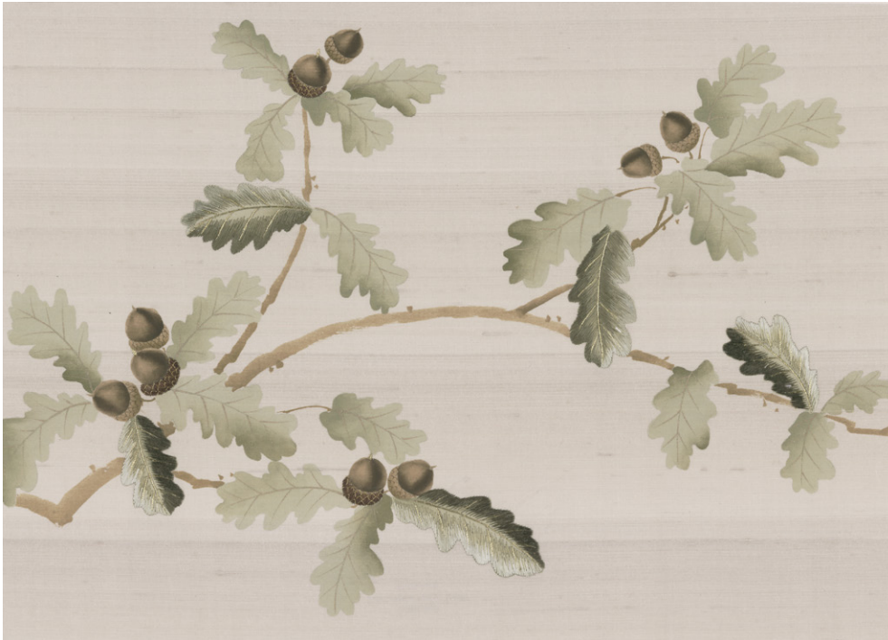
01 Bur on Enoki Dupion Silk