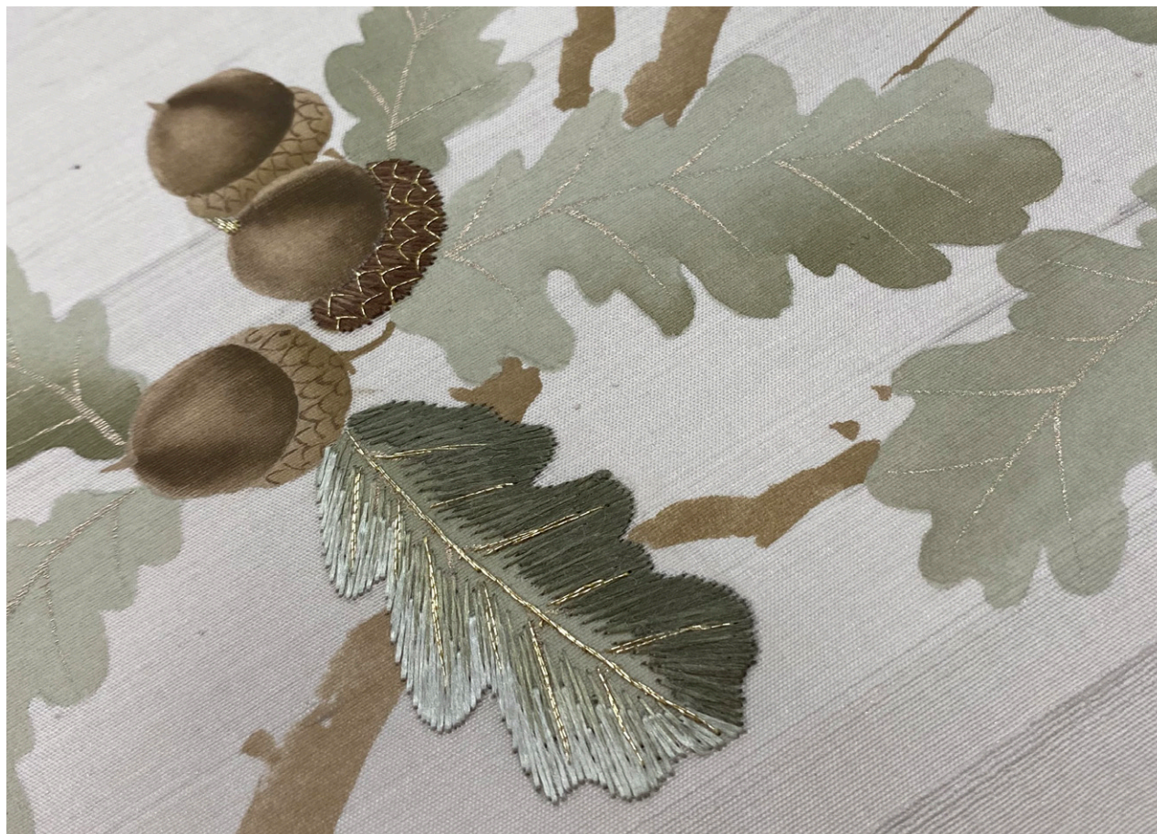
IMAGE Close-up of Oak Leaf in Bur

Available in two colourways; Bur, a naturalistic palette of greens, and Fig, a refined and tonal alternative.