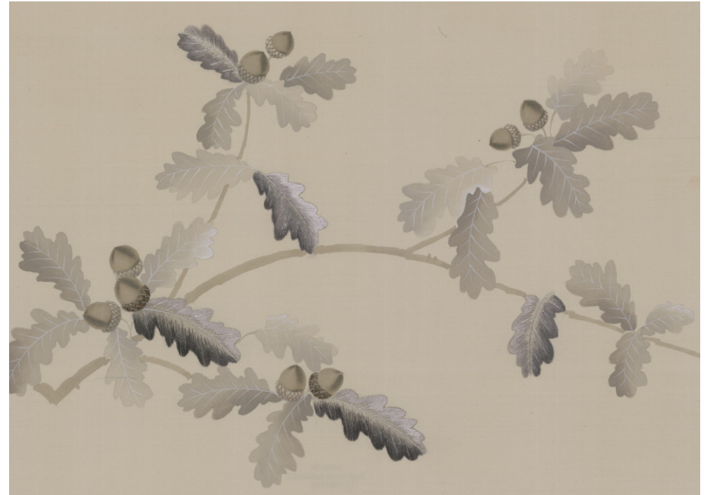
02 Fig on Moonlight Silk