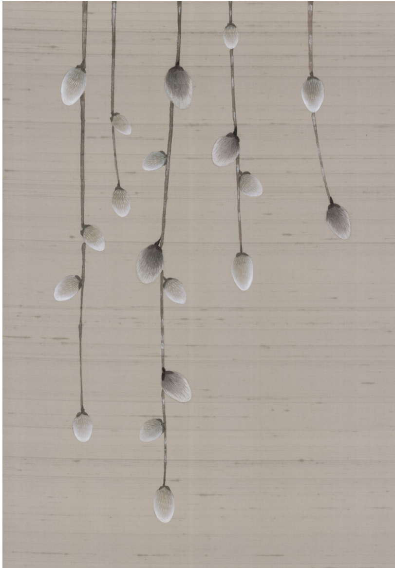
01 Doe on Enoki Dupion Silk