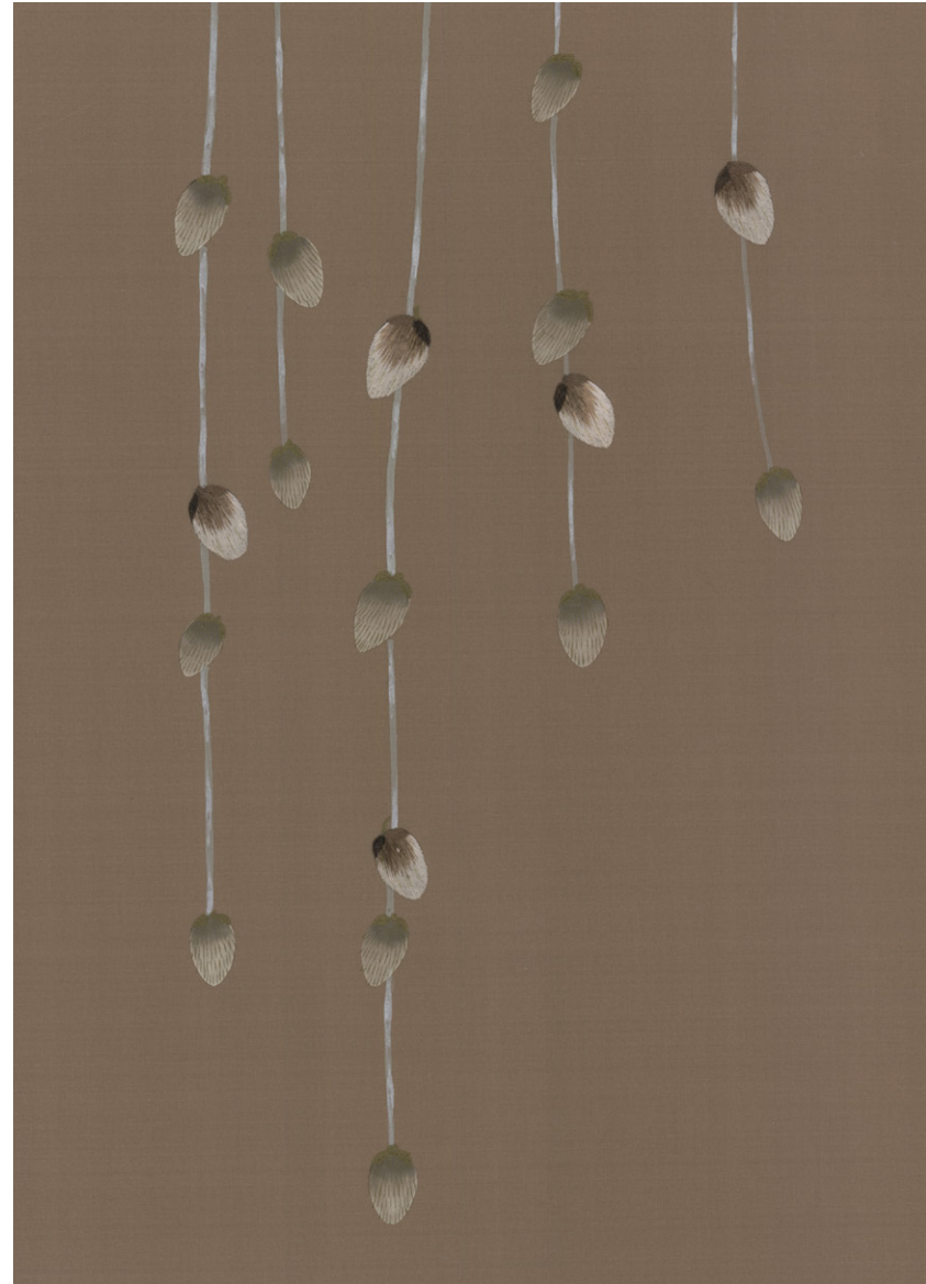
02 Tawny on Flint Silk