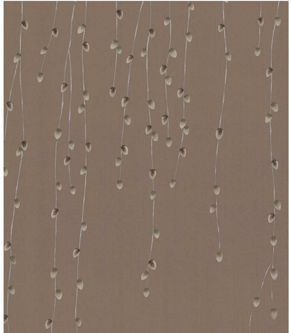
IMAGE Close up of Grey Willow in Tawny

Grey Willow is more linear and graphic, making it easy to compose seamlessly in any room. The subtle pops of colour mimic natural catkin hues, creating a delicate interplay that maintains a connection to organic inspiration.